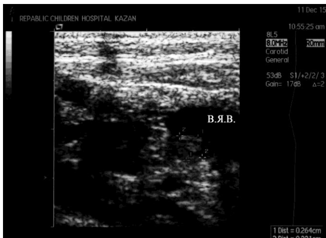
Figure 4. A thrombus in the lumen of the right internal jugular vein. The echogram. B.Я.B. – Internal jugular vein.