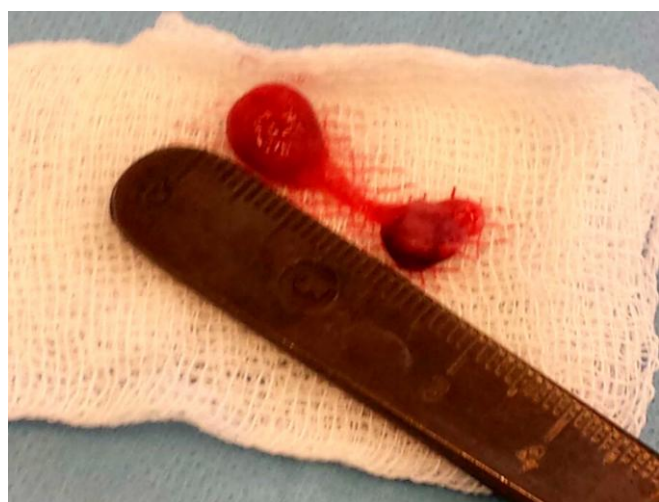
Figure 3. Thrombus of the right atrium.

The child underwent surgery on day 26 of life. The right atrium thrombus was removed under cardiopulmonary bypass. Surgical access was by longitudinal median sternotomy. For cardioplegia, a solution of Custodiol® was used. After cardiac arrest and opening of the right atrial cavity, a mobile thrombus 7x8x7 mm with a thin base with fixation near the mouth of the superior vena cava was detected, where the second part of the thrombus was located with dimensions 6x5x6 mm (Figure 2). The thrombus, as well as its base, were removed (Figure 3). Inspection of the tricuspid valve confirmed the absence of pathological changes in it. A standard disconnection of the bypass apparatus, renewal of the heart rhythm, drainage, and layer-by-layer closure of the thorax was performed. The total duration of the bypass was 46 minutes, including a cardiac arrest time 23 minutes.